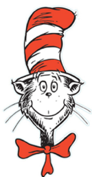
cat in the hat