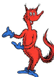
Fox in Socks